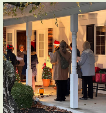
Christmas caroling to our at-home members!