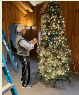
Hanging of the Greens