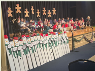
Santa brought gifts for the school!