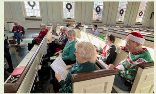
Onward & Upward Christmas Sing-a-long